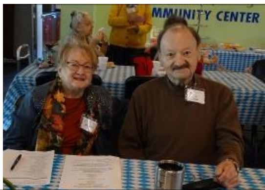
It was great to see the Imperial Ewerts

Trying to find something new to collect ... “Nope, got that ... got that ... got three of those ... got that in all eight colors they made ...”