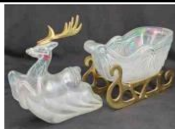
Fenton paired glass with metal sleigh runners and antlers on a coordinated deer.

Westmoreland's sleigh had a lid with Santa himself included as the handle. Several colors were made including a psychedelic Santa version. I love the others but have to give the prize to Westmoreland.