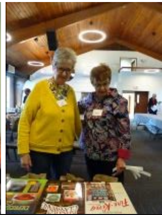
Have you noticed that halos often follow folks who love glass?