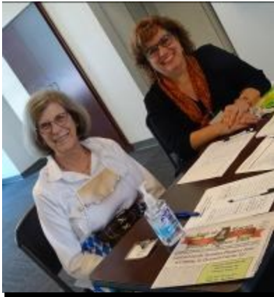
Happy to greet you