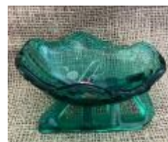
Fostoria's cute sleigh was made in several colors. Gotta get them all!