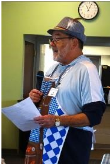
Just after the hour, a cuckoo comes out and reads an agenda