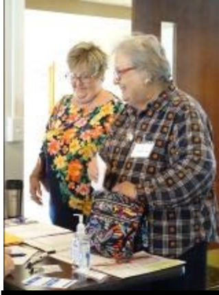
Happy to be greeted