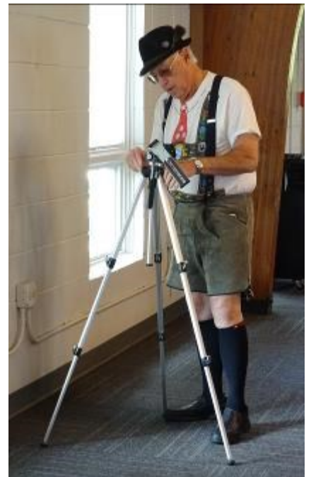
Ein Deutscher Mann mit FÜNF Beinen.