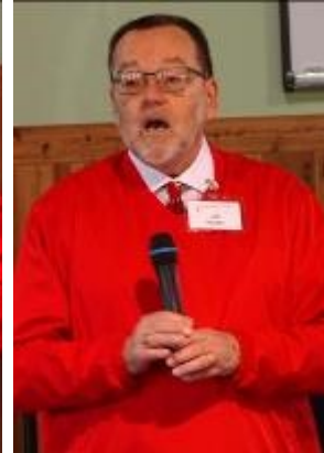
... and a little bit smart-assy!