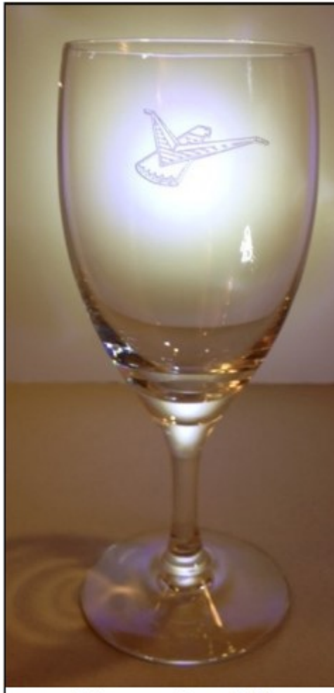
Silhouette Stem 6102 with Thunderbird Logo