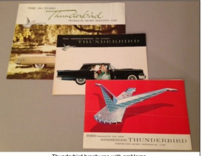
Thunderbird brochures with emblems

So what have we accomplished during the course of this investigation? We have a reasonable assumption of when these items were produced and a fairly reasonable explanation of why? Beyond that we have raised a "flock" of questions that will hopefully "migrate" to some answers during subsequent research. Or perhaps, someone reading this bought a shiny new Thunderbird in 1958 and this article will jog their memory. In any event the collectors in this house will continue to enjoy the products of this unusual collaboration that has given us items of mutual interest.