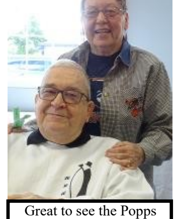
Great to see the Popps looking so well