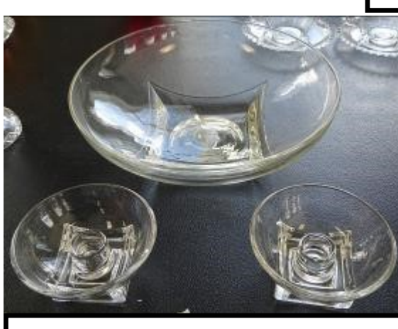
Some lucky person won this beautiful console-ation prize