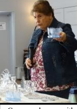
Cream and sugar with your presentation?