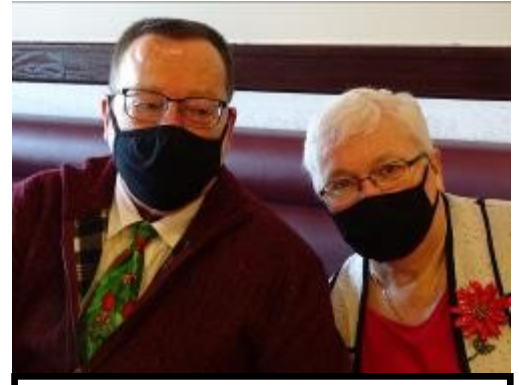
Our Fry-lovin' friends eyeing the prizes and trying to remember how much room is left in the Hoosier Cabinets back home in Indiana