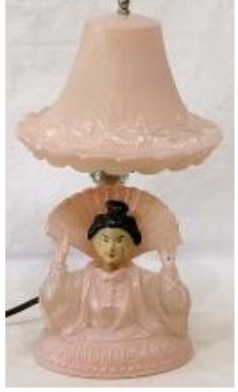
These are cool!