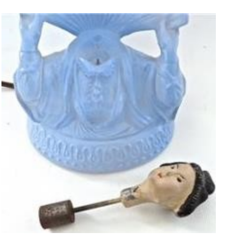
Weighted bottom of ceramic head allows it to nod