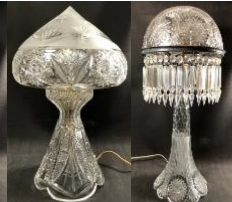
Three versions of Fry Foval lamps? Yes, please!