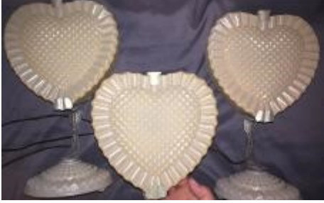
Identified as Klingberg Heart Shaped Boudoir set from 1940s. You would need a very ruffly bedspread to go along with these.