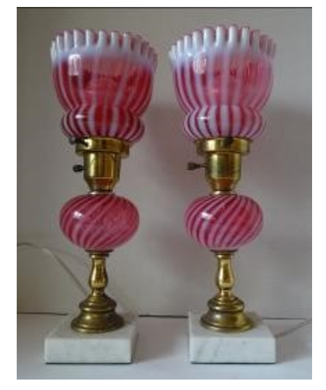
From the House of Unger survivors of a harrowing delivery