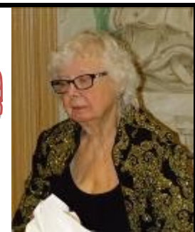
At the 2019 Holiday Party. Daydreaming of bingo prizes?