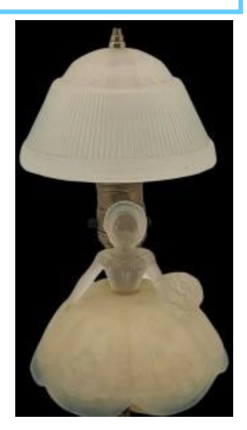
"Sally" shows 3 shade styles and colors. The last is frosted crystal and she has short sleeves, not puffy. Houze?