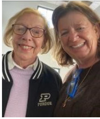
The Dames with the Dishes