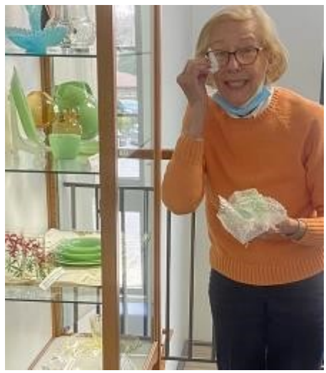
Don't cry because its over, smile because it happened. -Dr Seuss