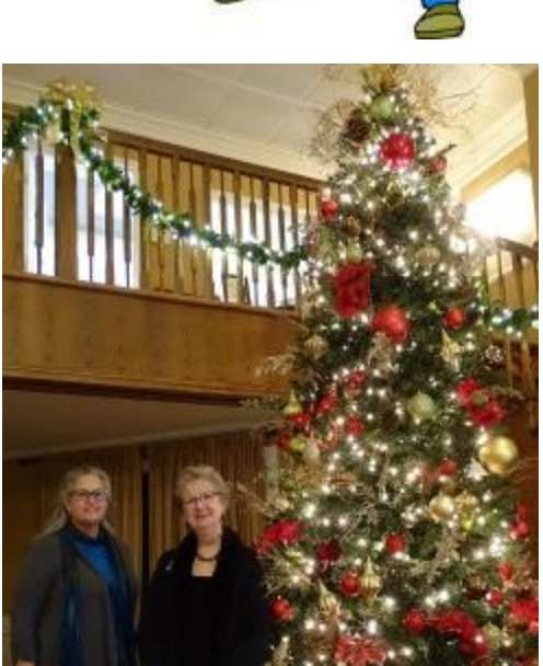
Merry and bright CELEBRATE!