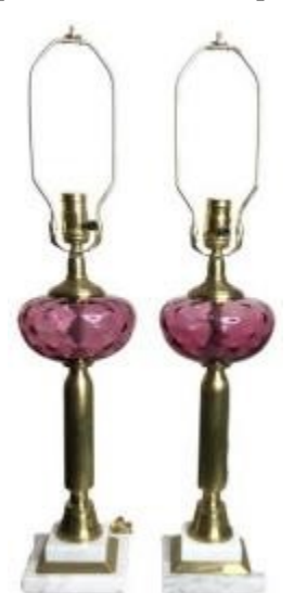
Cranberry Dot Optic