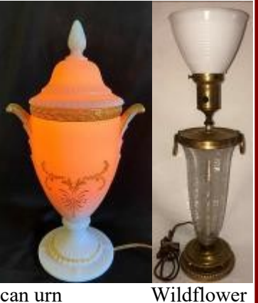
Crown Tuscan urn