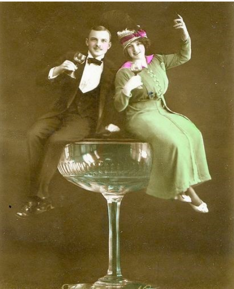
Don't try this at home