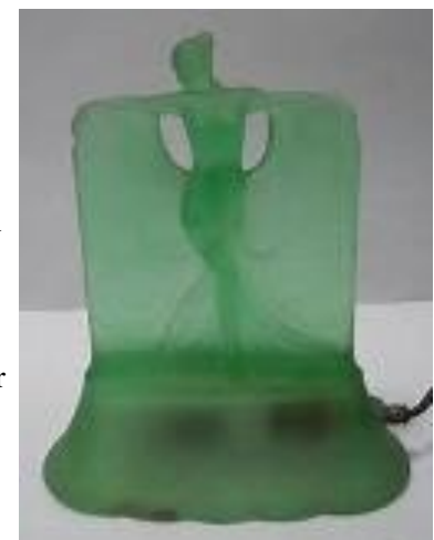
Original McKee lamp

I'd like to know if these were adapted from a pair of McKee lamps, or if maybe McKee offered them that way.