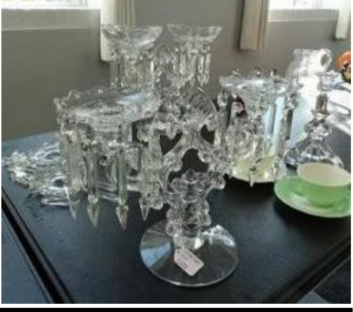
We had more candelabras than a Liberace concert