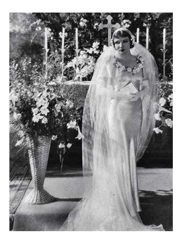
Claudette Colbert, It Happened One Night , 1934 It's a GREAT film.