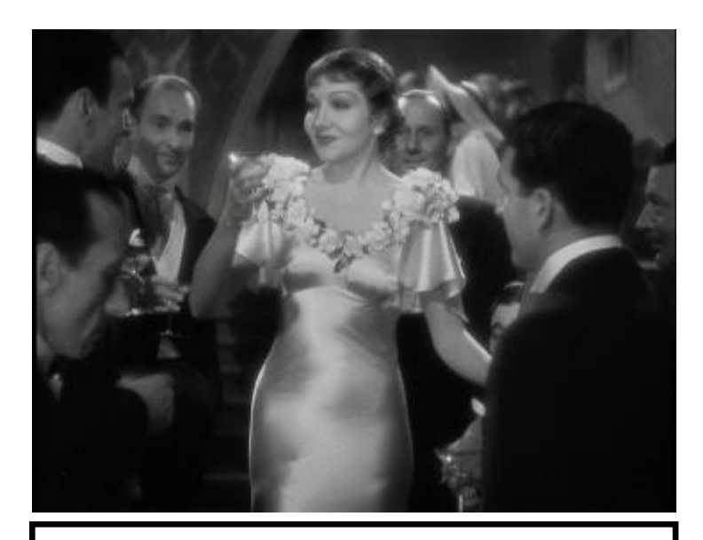
A toast to the bride and American made glass! The center of attention at any wedding is ... obviously the sparkling new glassware she has chosen. COME JOIN US FOR A SOCIETY WEDDING