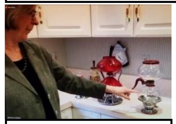
Mary's kitchen museum would be an interesting and informative place to have tea and coffee