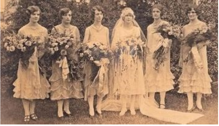
There was a beautiful glass pattern for every beautiful bride.