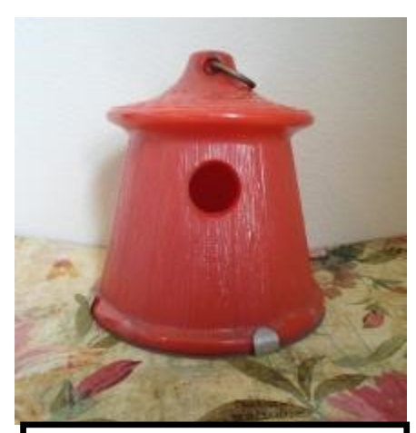
A red example of the Wrens Honeymoon Hut. Note bottom is removable for cleaning.