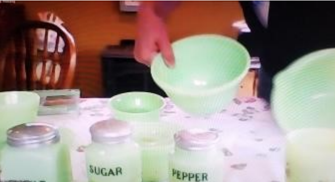
Angela's beautiful Jadeite collection provided us with a pop of spring color when we really needed it!