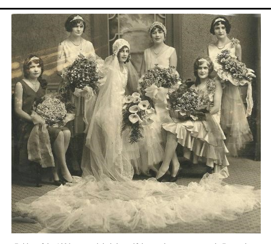
Brides of the 1920s wanted their beautiful new glassware to match. But, at least for this gal, matching bridesmaid outfits didn't seem to matter. Anything goes!

April Love, Beloved, First Love, Courtship, True Love, Engagement, Betrothal, Announcement, Intimate, Romance, Love song, Bridal Belle, Bridal Crown, Bridal Shower, Bridal Wreath, Bouquet, Flower Girl, Bridesmaid, Rehearsal, Wedding Flower, Something Blue, Wedding Ring, Matrimony, Trousseau, Anniversary